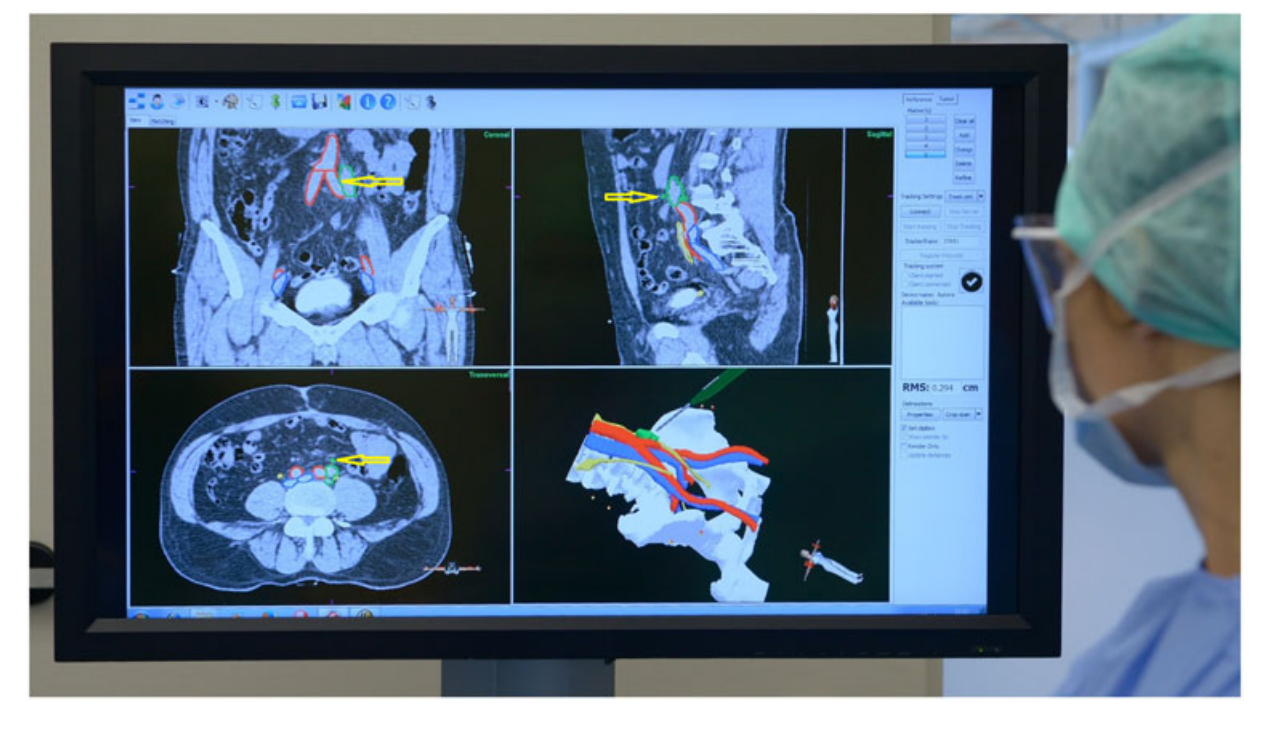
FIGURE 2 Picture of the surgical navigation user interface as it was provided to the surgeons. The planning CT scan is shown in the 3 orthogonal views, including the segmentations. In the lower-right corner a 3D render of the segmentations is shown. The slice of the CT scans in the orthogonal views is automatically selected based on the location of the surgical pointer (highlighted with the yellow arrows. A digital 3D render of the pointer is also shown in the 3D render. In this case a lymph node at the left iliac communal artery was the target (lime color). 3D, three-dimensional; CT, computed tomography [Color figure can be viewed at wileyonlinelibrary.com]

placed on the skin of the patient. One on the back in the lumbar curvature, and two on the left and right anterior superior iliac spine (Figure 3). The outlines of the trackers were marked using a semipermanent skin marker. Two supine intravenous contrast-enhanced CT scans were acquired, one in the arterial phase and one after 5 minutes for the ureters.