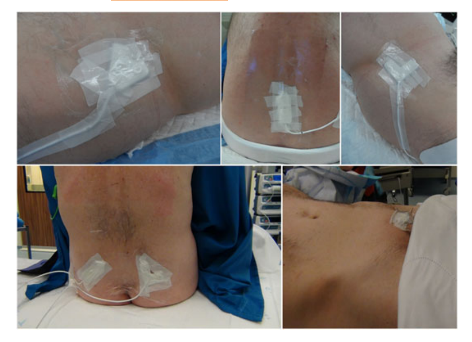
FIGURE 3 Top: Patient tracker positions in the initial workflow, with trackers on the left anterior iliac spine (left), the lumbar curvature (middle), and right anterior iliac spine (right); Bottom: Patient trackers in the workflow with intraoperative imaging, with two trackers in the lumbar curvature (left) and one at the pubic bone (right) [Color figure can be viewed at wileyonlinelibrary.com]

registration error of the patient trackers was evaluated by calculating the residual distances between the tracker positions as derived from the (CB)CT scan to the tracked positions after registration (tracker registration error). The tracker registration error was summarized per patient by quadratic calculating the average residual distance over the six residual distances (taking the root of the mean of the squares of the six distances). This accuracy is indicative for how reproducible the trackers can be applied to the skin of the patient. Second, the accuracy of the navigation system was tested by localizing easily recognizable abdominal landmarks during surgery. The surgeons were asked to point at the aorta and common iliac artery bifurcations while being blinded from the navigation system. The actual distance of the pointer tip to the bifurcations within the navigation system was assessed as the target registration error. Third, the surgeon was asked to localize the ureters using the navigation system. If needed for the operation, the ureter position was confirmed by opening the retroperitoneal space. If this was not part of the operation, the surgeons visually assessed if the location was correct within a range of 5 mm.